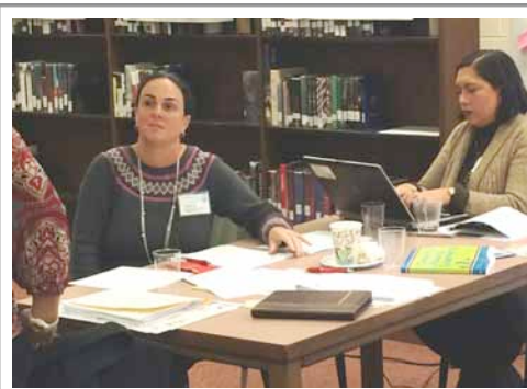
Below: Members-at-Large working during the February Meeting at Atlee High School.