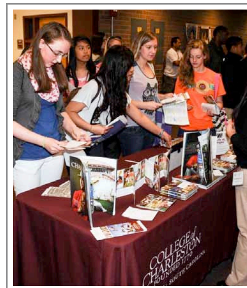
Above: A scene from the hallways of Garfield High School at the 2014 IBMA College Fair.

THE IBMA MISSION: The Mid-Atlantic Association of IB World Schools fosters a collaborative environment for all members to serve and advocate for IB World Schools throughout the region.